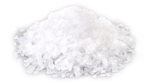
Z4 Sugar crystals White