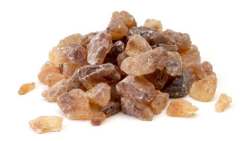
Z5 Sugar crystals Rock