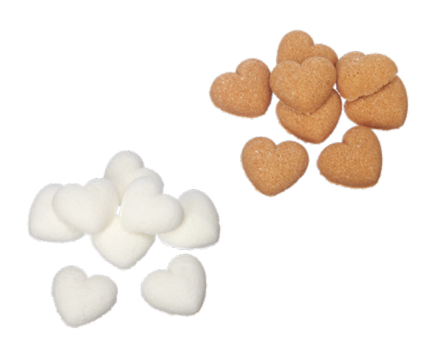
Z19 La Via del Tè heart shaped sugar White, singly wrapped

Z20 La Via del Tè heart shaped sugar Brown, singly wrapped