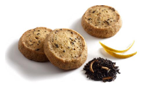
BS28S La Leggenda di Boboli tea and lemon rind