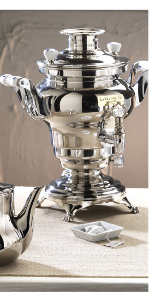
Tea is a beverage of tranquility, comfort and refinement Arhur Grey, British writer

The product lines are designed to meet the various needs of the Hospitality sector, offering elegant and functional solutions for Hotels, Restaurants, lounge bars, SPAs and tea rooms.