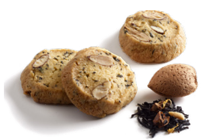
BS29S Il Mistero della Venere tea and almonds