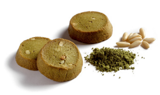
BS25S Matcha tea and pine kernels