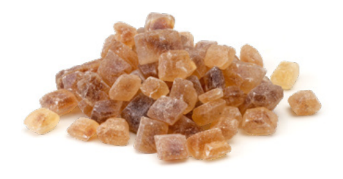
Z6 Sugar crystals Rock cubes Brown