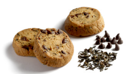
BS23S Earl Grey Imperiale tea and chocolate drops