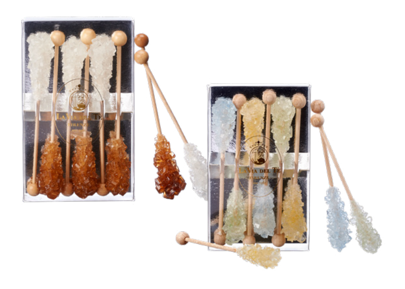
Z21 Sugar cane crystals stick - white and brown (11,5 cm)

Z20 La Via del Tè heart shaped sugar Brown, singly wrapped